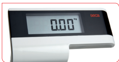
The display on a high pedestal is easy to read.

What is simpler than the step-off function? Simply stand on the scale without switching it on, wait for "step-off" on the display, then step off at leisure and read off the measurements. This is ideal particularly for pregnant women and people of larger girth. You see, a scale from seca is on the ball. It's just one of the reasons why seca has been the global market leader in the field of medical weighing and measuring for many years.